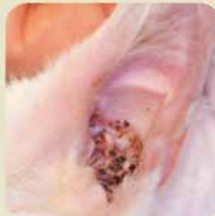
Otitis externa in a cat with ear mites ( Otodectes cynotis ). The photo shows the characteristic crusty brown discharge in the external ear canal