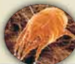
Electron micrograph of the ear mite – Otodectes cynotis